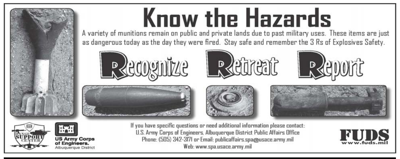
Rip Rap — December 2011 — Page 6

Kate Walker wrote, "The spent munitions were the last of more than 13,700 pounds of known munitions fragments excavated from the World War II era range, which was first used as a training ground for bomber pilots in 1942."