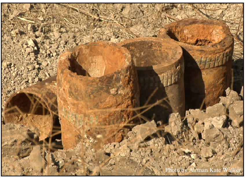
The final four spent munitions were detonated at the former Badlands Bombing Range, S.D., as part of a cleanup process.

The District and the South Pacific Division's Range Support Center have been managing and executing contracts at this property since November 2009 for the purpose of cleaning up any remaining military munitions and completing a decision document supporting the