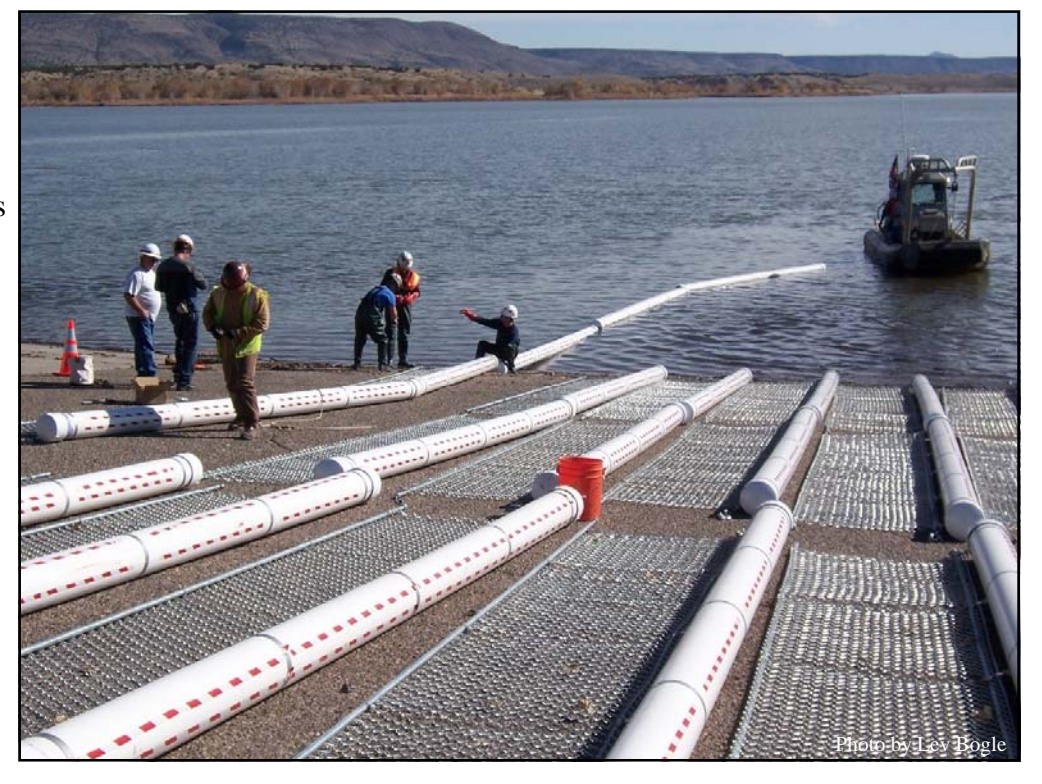
The Corps installed 50, 20-foot-long log booms in the canyon portion of Cochiti Lake, a half mile upstream of the Tetilla boat ramp, to catch debris.

The booms are made of foamfilled, 8-inch diameter PVC pipe and are connected by