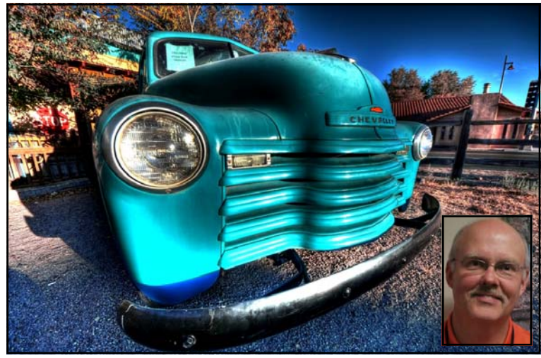
Specifications Technician Richard Banker won an honorable mention for this vibrant picture in the 2011 Army Digital Photo Contest. The photo was entered in the "digital darkroom" category.