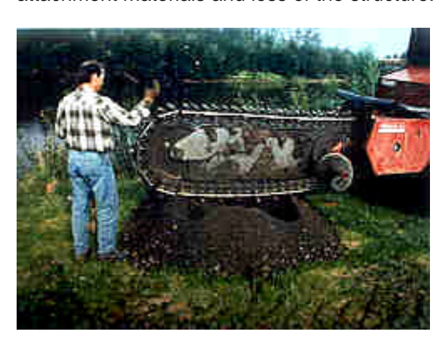
Figure 6. Ditches used to run cables from LWD to anchors on the top bank

For anchors placed on the top bank, a ditch may be required between the LWD and the anchor so that the cable can be tightened sufficiently to secure the structure (Figure 6). Failure to adequately anchor the LWD to the bank can result in scour between the tree bole and the bank that can destabilize the structure and in severe cases, can destabilize the bank. Loose structures will also oscillate in the current and can result in failure of anchors or attachment materials and loss of the structure.