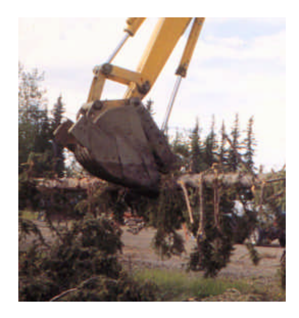
Figure 8. An excavator with a "thumb" used to place LWD

rehabilitation techniques, such as reforestation of riparian zones and stabilization of sediment sources in the watershed. The use of large woody debris for stabilizing actively eroding