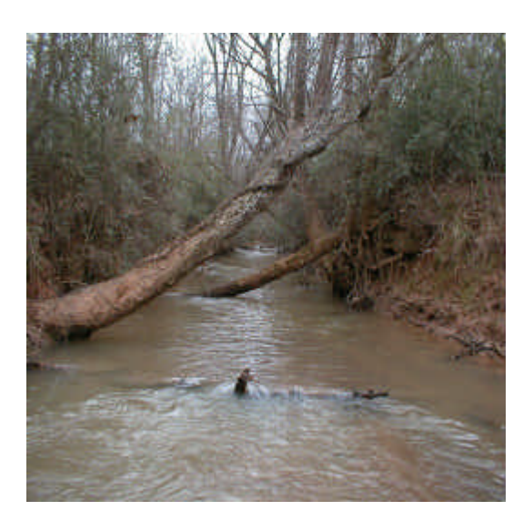
Figure 1. Stream in southeast U.S. with several types of LWD

The amount of LWD in streams is affected by anthropogenic factors. Large woody debris has been removed from streams for a variety of reasons including improved navigation, reduction of flow resistance, flood control, and perceived fish passage problems. Large woody debris is usually removed during channelization operations. Clearing of riparian vegetation whether due to channelization operations, agriculture, forestry practices, or urbanization reduces LWD recruitment. Alternately, urbanization, channelization and other actions that lead to channel incision can initiate systemic channel instabilities that lead to a significant introduction of LWD into a stream.