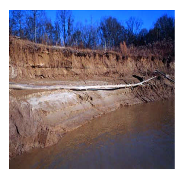
Figure 5. Large woody debris placed by a contractor that has had all limbs removed prior to placement