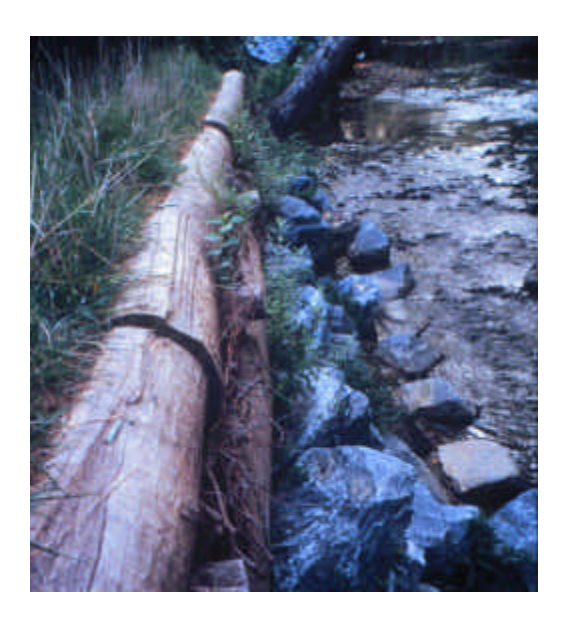
Figure 3. Category 2 LWD structure used to stabilize a stream bank

The amount of LWD in streams, especially middle- and high-order streams, is often underestimated with a resultant overestimation of the need to add more. Thus, category 1 project streams should be examined during low flow conditions to determine the quantity and distribution of LWD using modified forestry techniques. These can be compared to values from relatively pristine streams obtained from the scientific literature. Assessing the need for a category 2 project requires a determination of limiting factors. This may be readily apparent in highly degraded streams but may require surveys and comparisons to pristine streams for healthier systems.