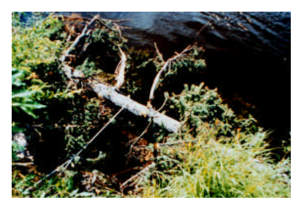
Figure 2. Category 1 LWD structure

Large woody debris commonly placed into streams can be categorized as three types: whole trees, logs, and root wads. A whole tree is a tree cut off at the stump with all or most of the limbs attached, including terminal branches. Logs are sections of the bole with all limbs removed. Root wads consist of the root portion of the tree and a section of the bole. A fourth category including brush mattressing and brush revetments will be covered in EMRRP Technical Note SR-22.