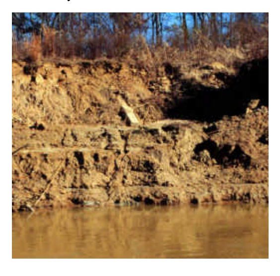
Figure 4. Deadman anchor that failed due to bank erosion

However, these species are usually the most desirable for lumber and, therefore, the most expensive, so compromise will often be necessary.