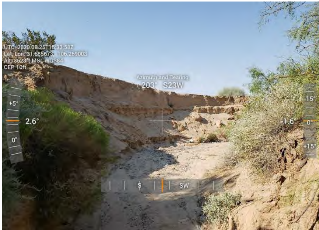
Photo 7: General view of the central to downstream extent of ES-1, facing downstream and west-southwest.