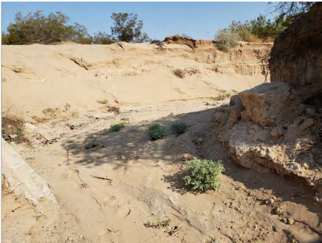
Photo 4: View of upstream to central portion of ES-1, facing downstream and west-southwest.