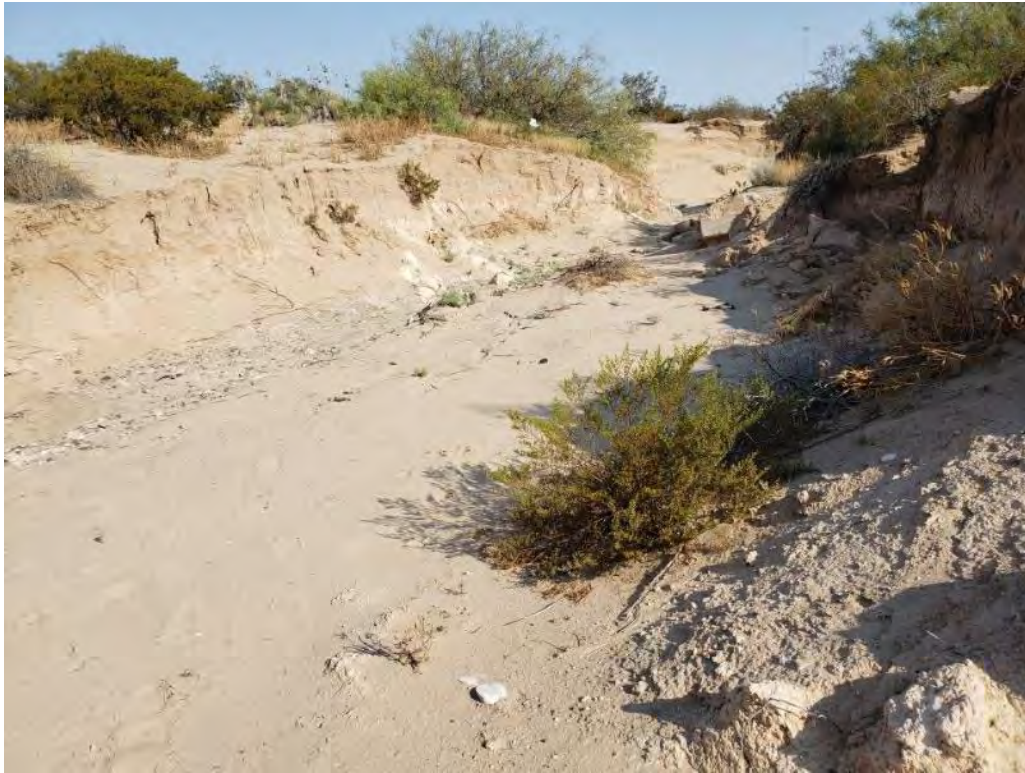
Photo 3: View of upstream portion of ES-1, facing downstream and west-southwest.