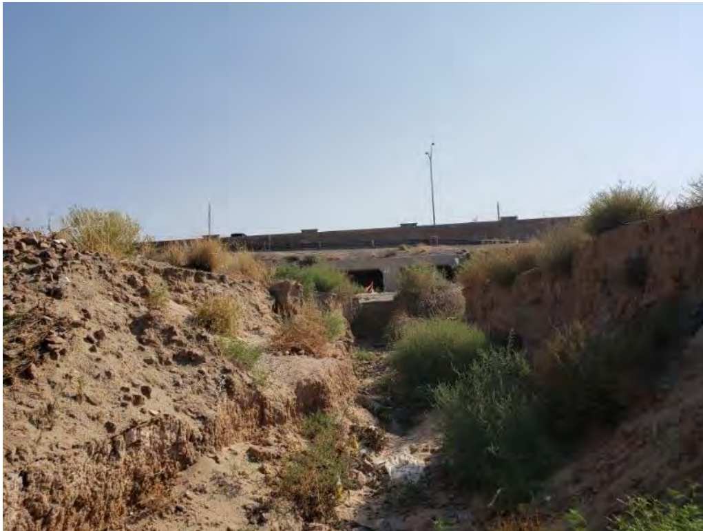
Photo 1: Overview of ES-1 at upstream extent, the unpaved road, culvert and I-10 visible, facing upstream and northeast.