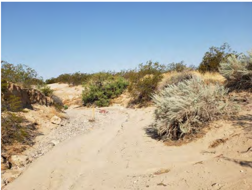
Photo 10: General view of the downstream extent of ES-1 within Project (stake demarcates boundary).