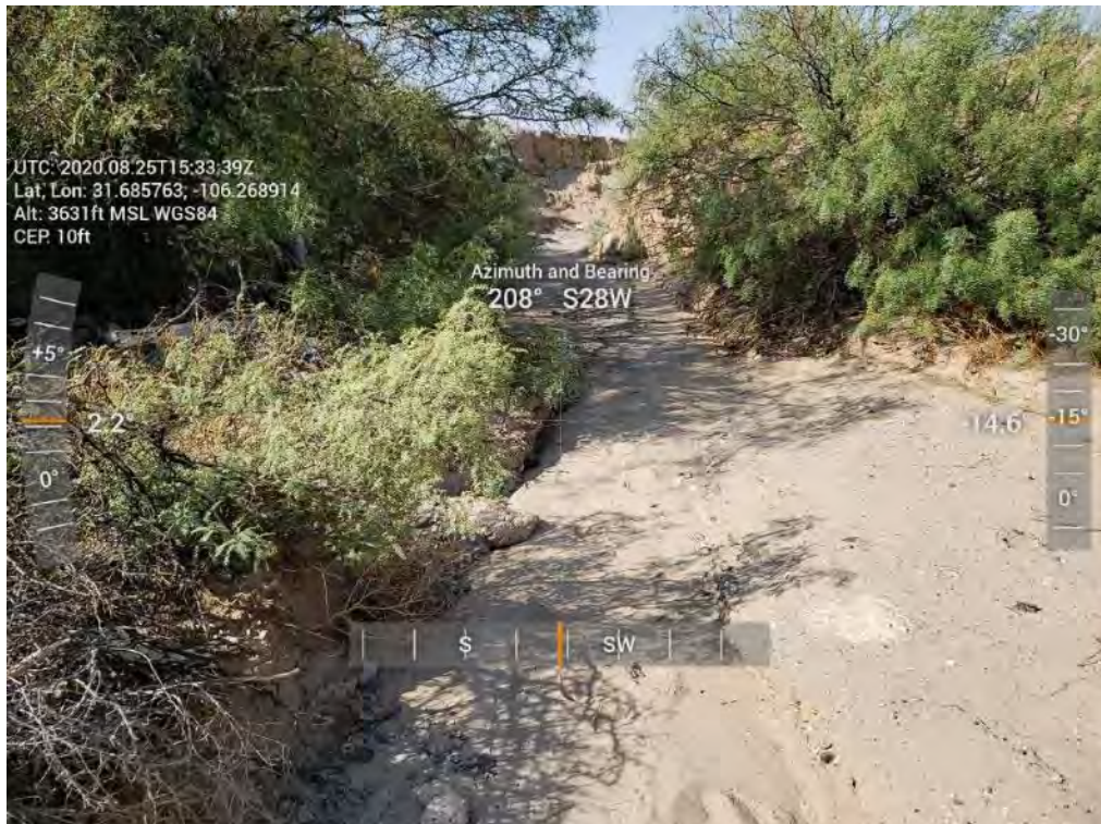
Photo 9: General view of the downstream extent of ES-1, facing downstream and west-southwest.