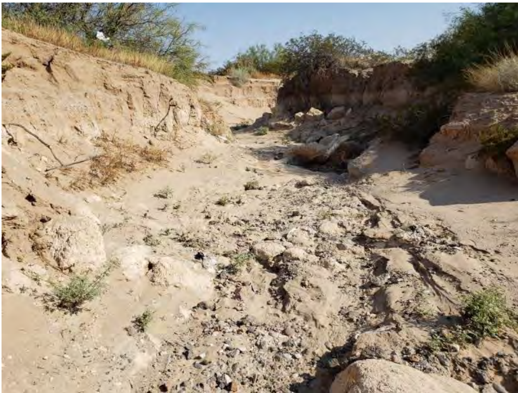
Photo 2: View of upstream portion of ES-1, facing downstream and west-southwest.