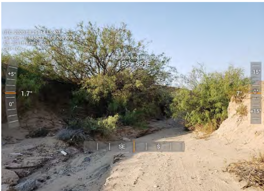
Photo 8: General view of the downstream extent of ES-1, facing downstream and west-southwest.