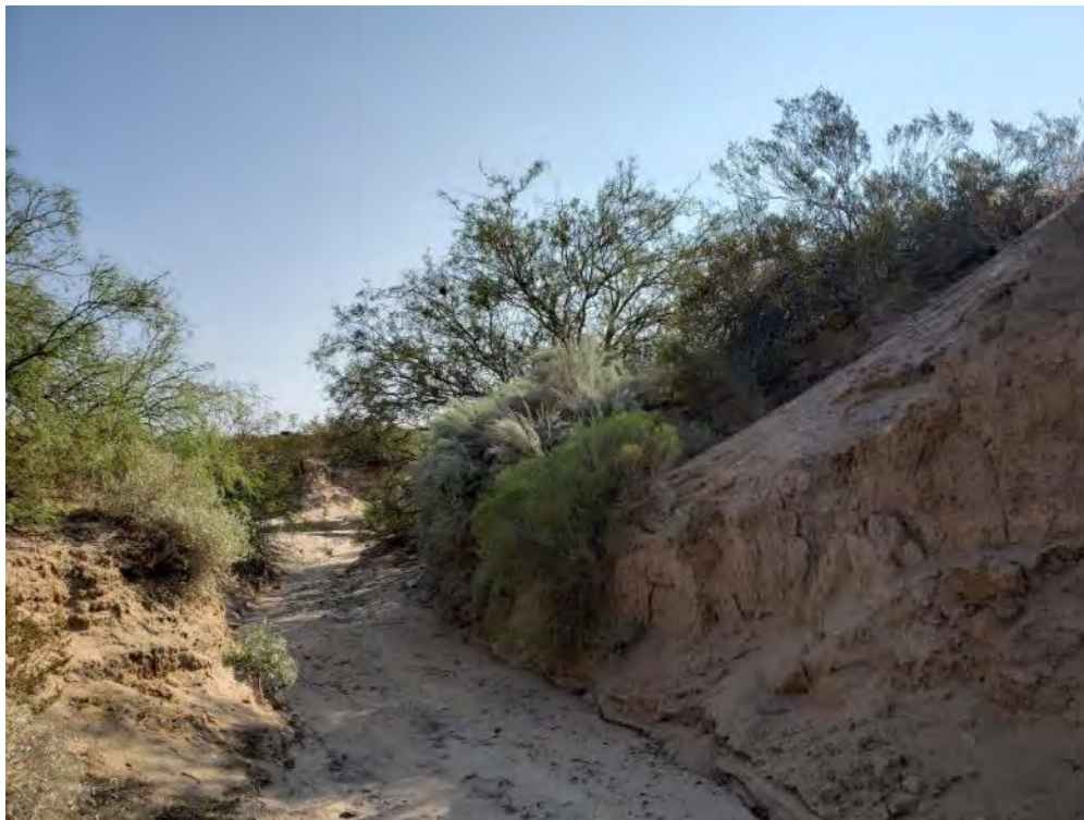
Photo 6: General view of the central to downstream extent of ES-1, facing upstream and northeast.