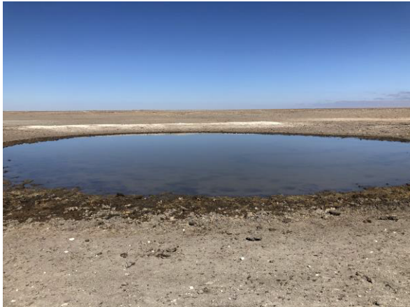
7. View of livestock pond.