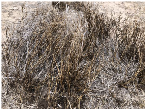
13. View of short grass, common throughout subject site.