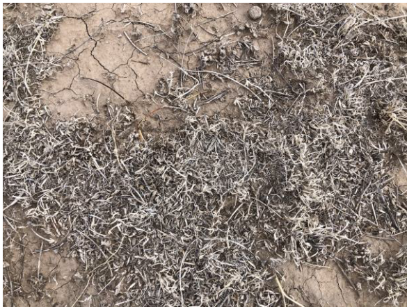
3. View of vegetation in area of SP-1.