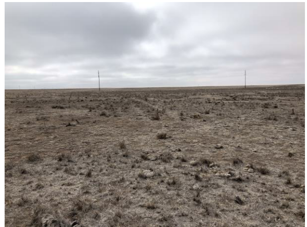
4. View of shallow depression (Lake on NWI map).