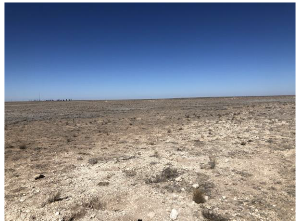
10. View of depressional area, cattle grazing onsite in the distance.