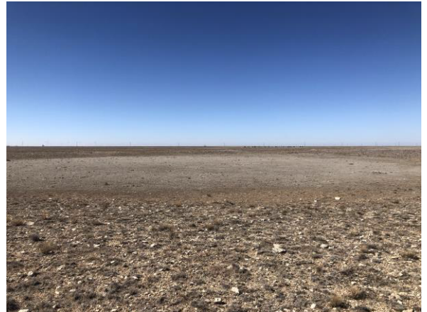
8. View of depressional area in central area of the site.