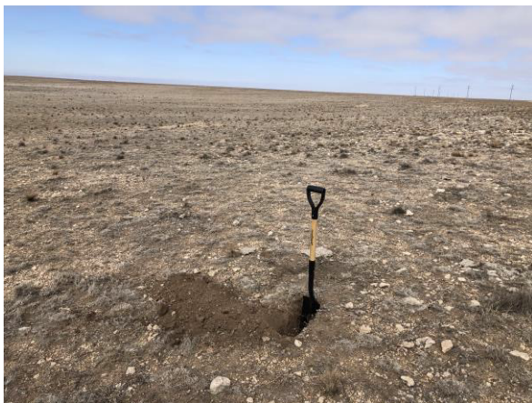
5. View of SP-2, upland of depression/lake area.