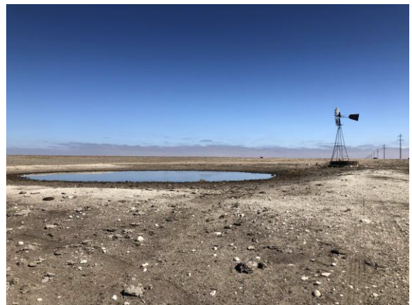
6. View of livestock pond on northeastern side of site.