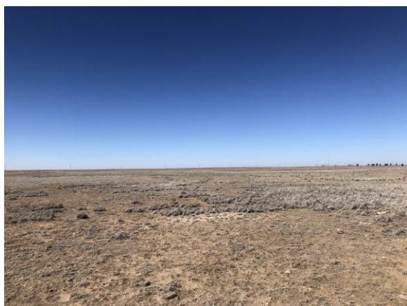
15. View of scrub vegetation common throughout site.