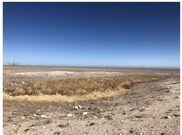
12. View of drainage area coming from livestock pond.