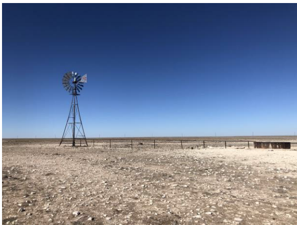
11. View of livestock pond offsite, leading to drainage on western side of site.