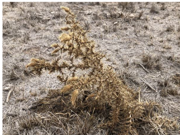
14. View of thistles, common throughout site.