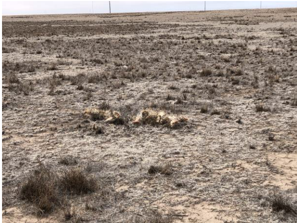
1. View of common onsite vegetative communities on northwestern portion of the site.