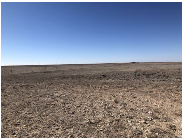
9. View of depressional area along southern boundary of site.