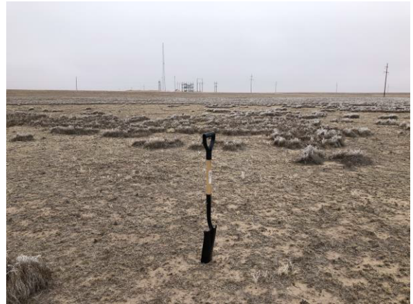
2. View of SP-1, in basin of depression area (Lake on NWI map).