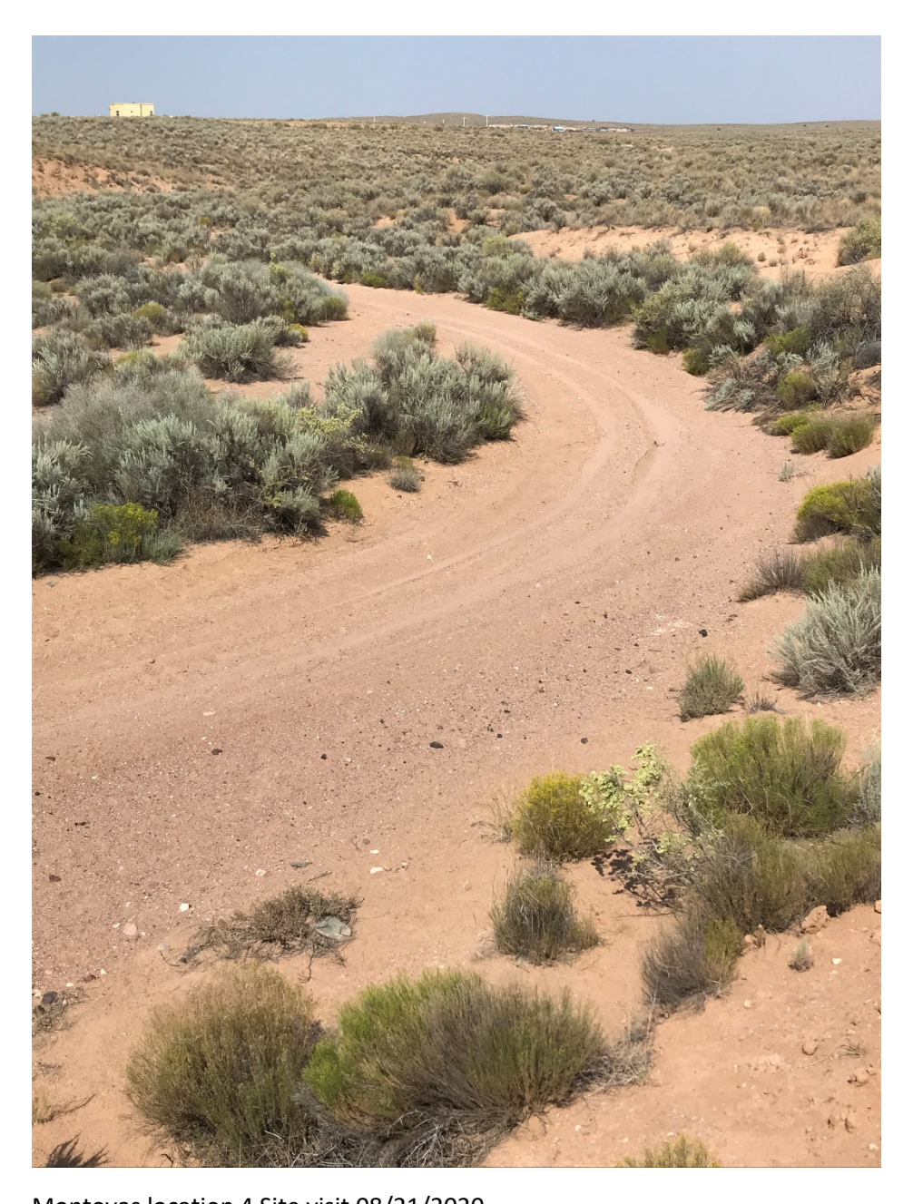
Montoyas location 4 Site visit 08/21/2020 Norther area of site near Lomates Loop Road looking north (upstream)