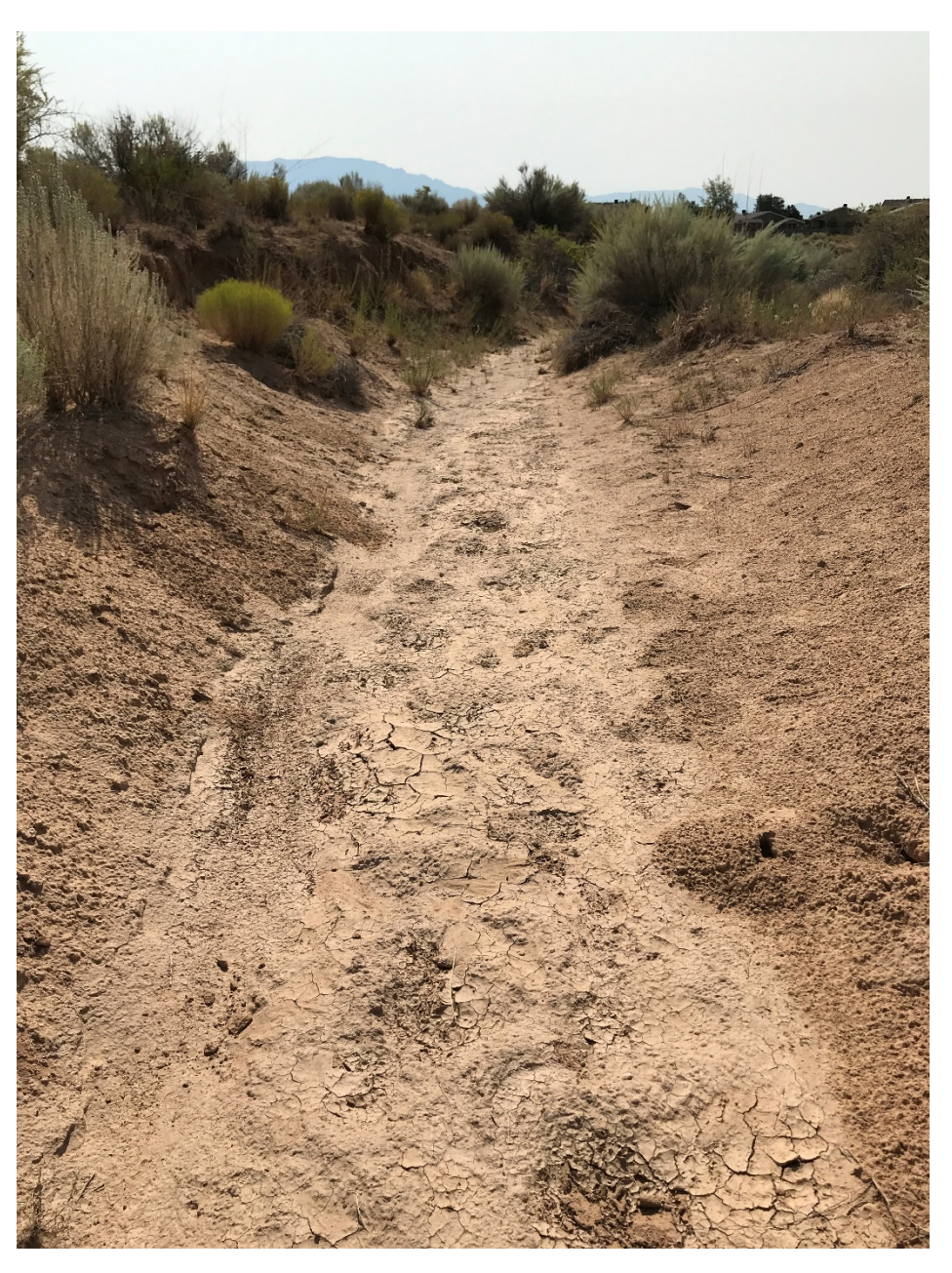
Montoyas location 3 Site visit 08/21/2020

Norther area of site near Montezuma Blvd NE looking south (Downstream)