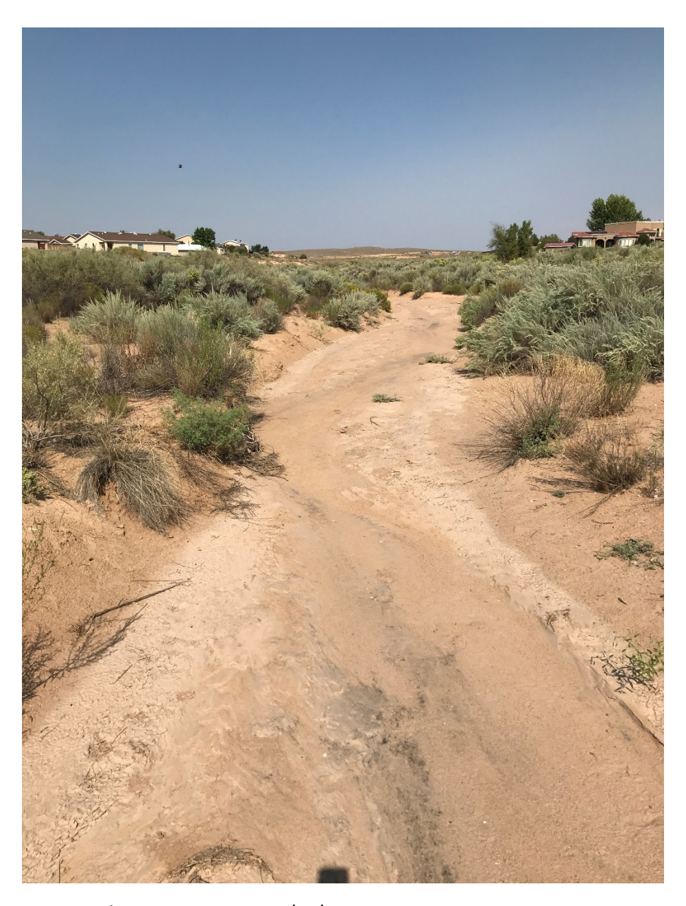
Montoyas location 3 Site visit 08/21/2020 Southern area of site near Loma Colorado Blvd NE looking north (upstream)