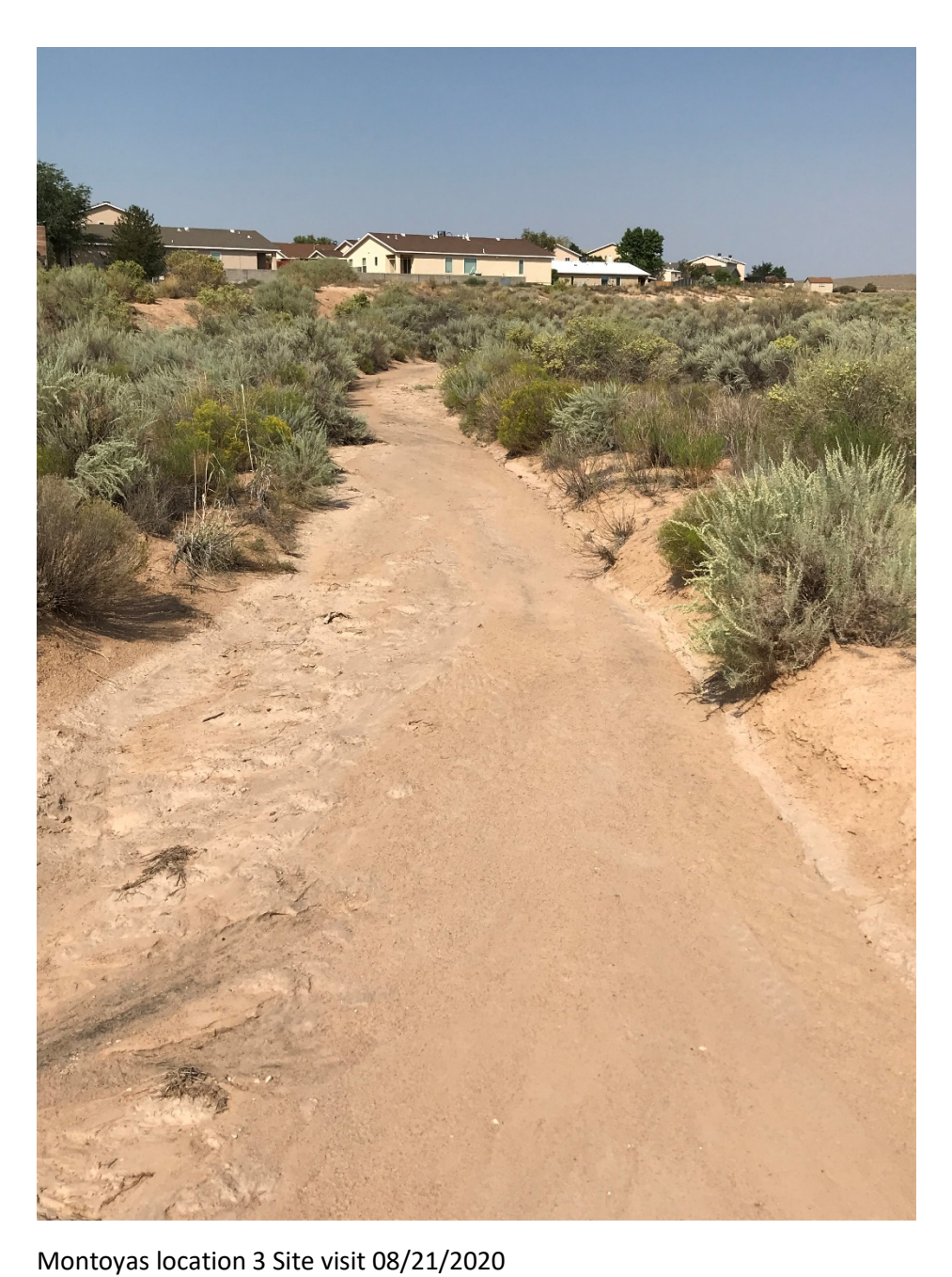
Southern area of site near Loma Colorado Blvd NE looking north (upstream)