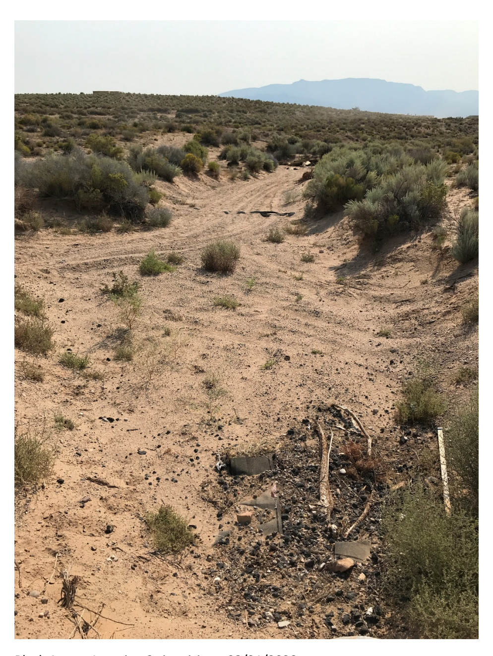
Black Arroyo Location 2 site visit on 08/21/2020 Norther most arroyo looking upstream near 11<sup>th</sup> Ave SE