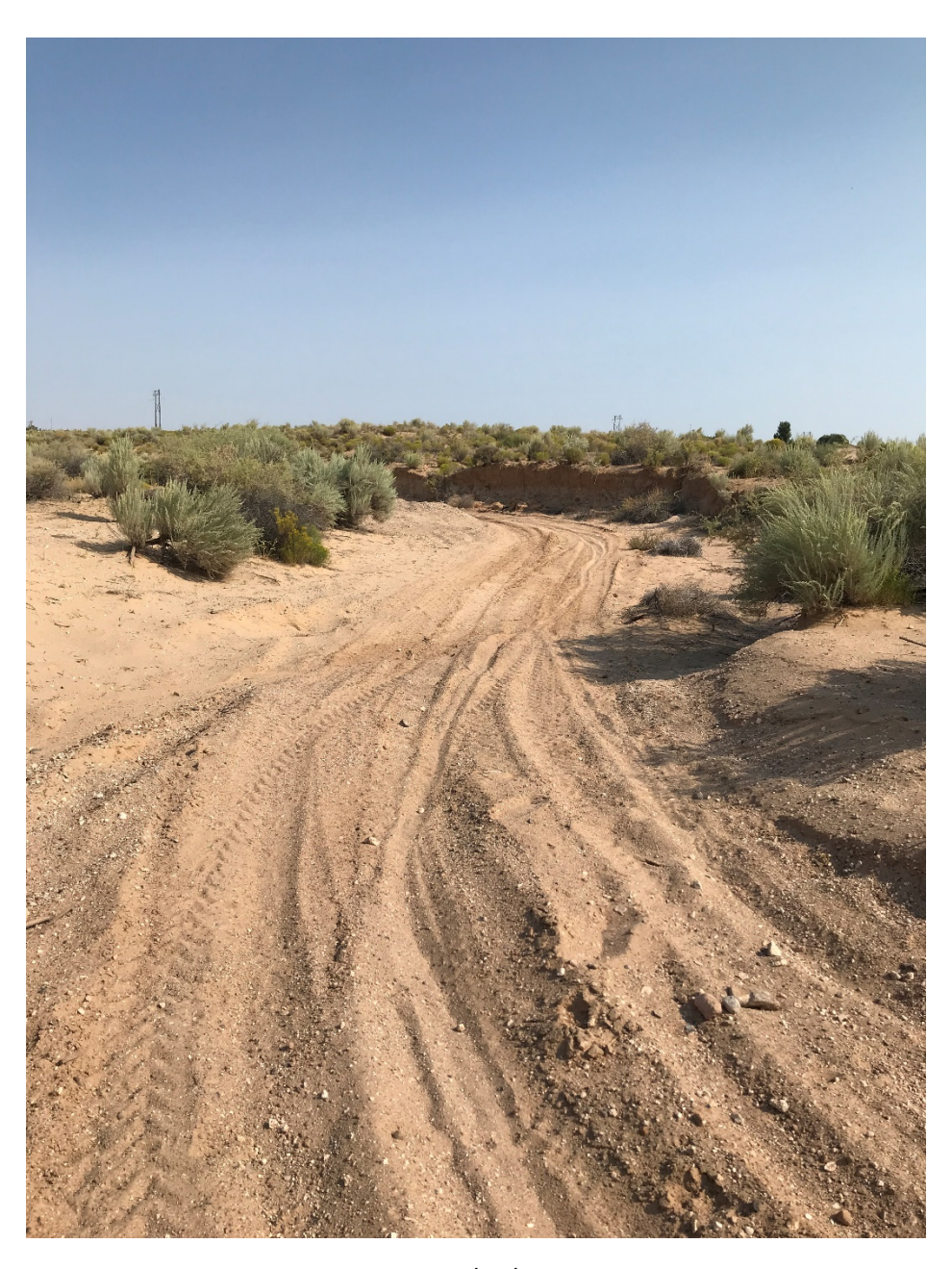
Black Arroyo Location 2 site visit on 08/21/2020 Norther most arroyo looking upstream near 11th Ave SE