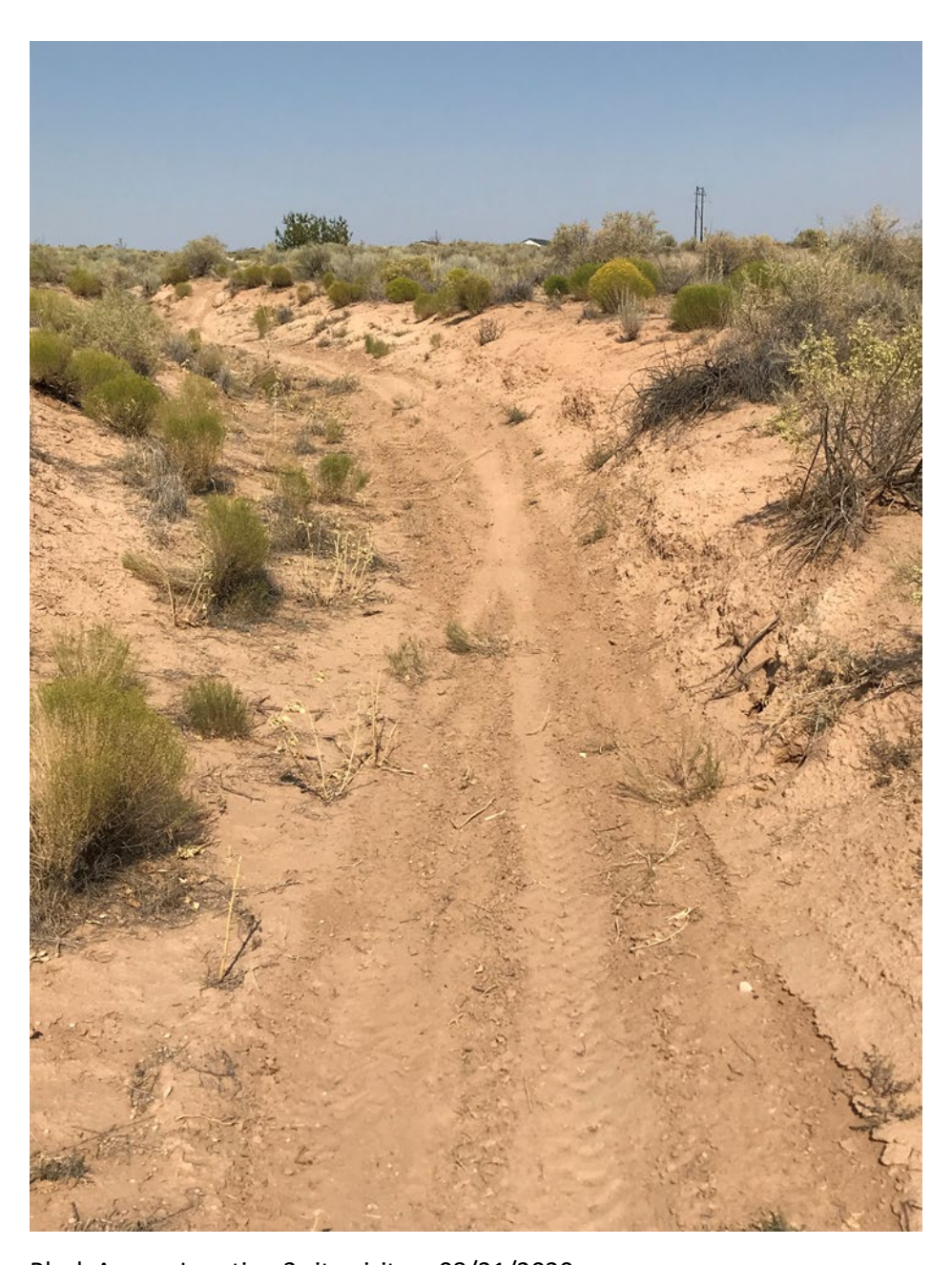
Black Arroyo Location 2 site visit on 08/21/2020 Southern most arroyo looking upstream near 11th Ave SE