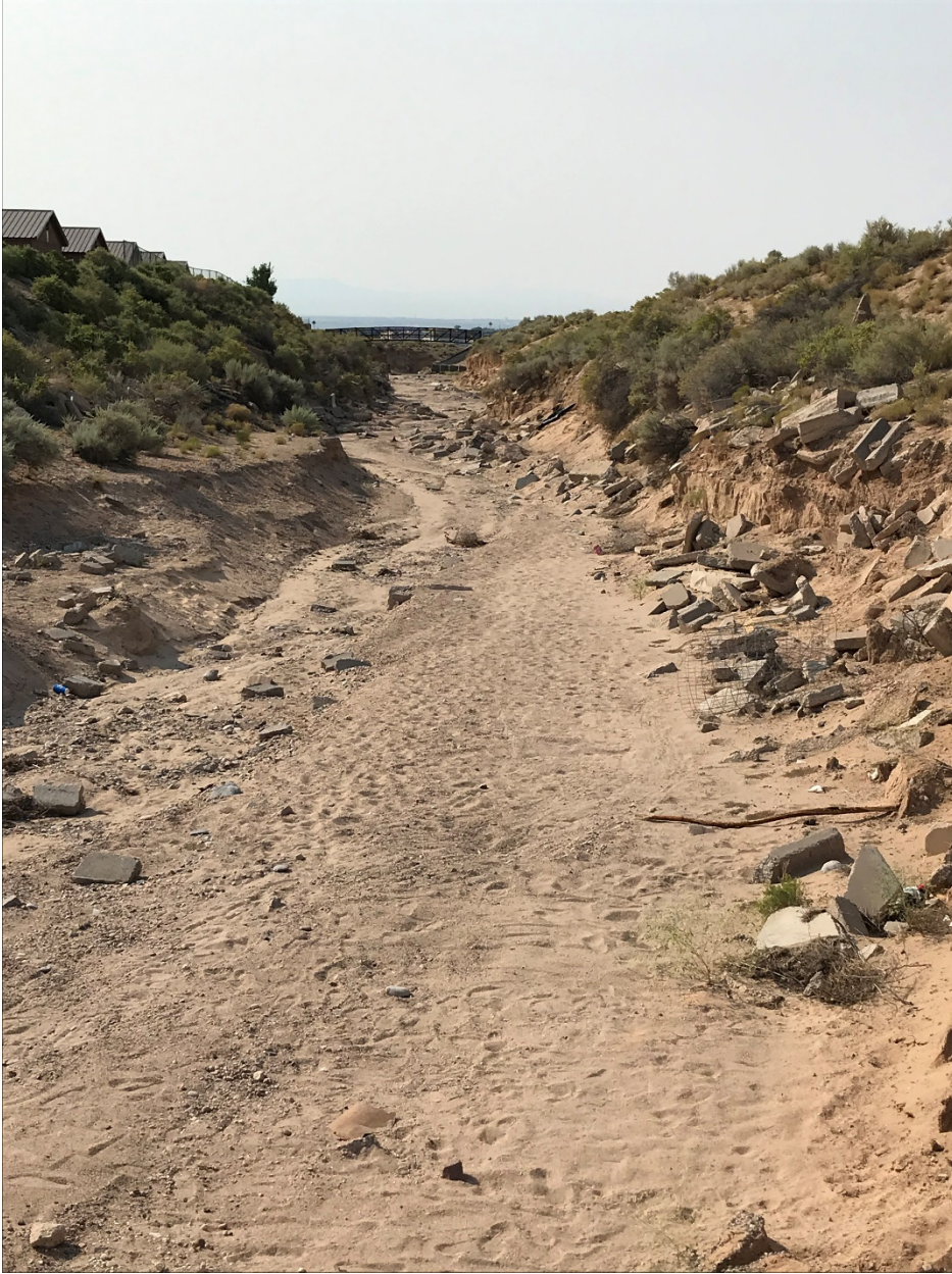
Site Visit 08-21-2020 Black Arroyo Location 1