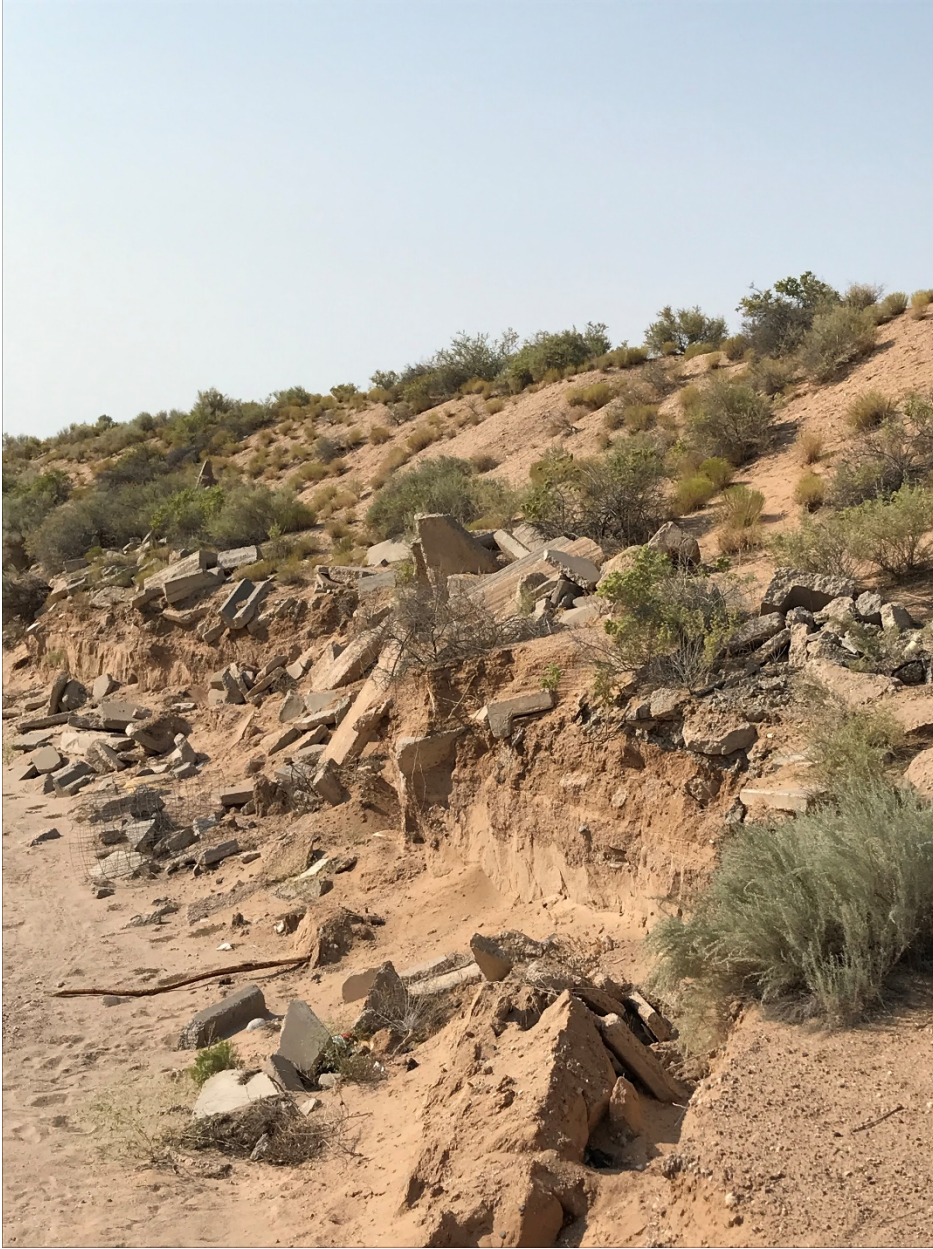
Site Visit 08-21-2020 Black Arroyo Location 1