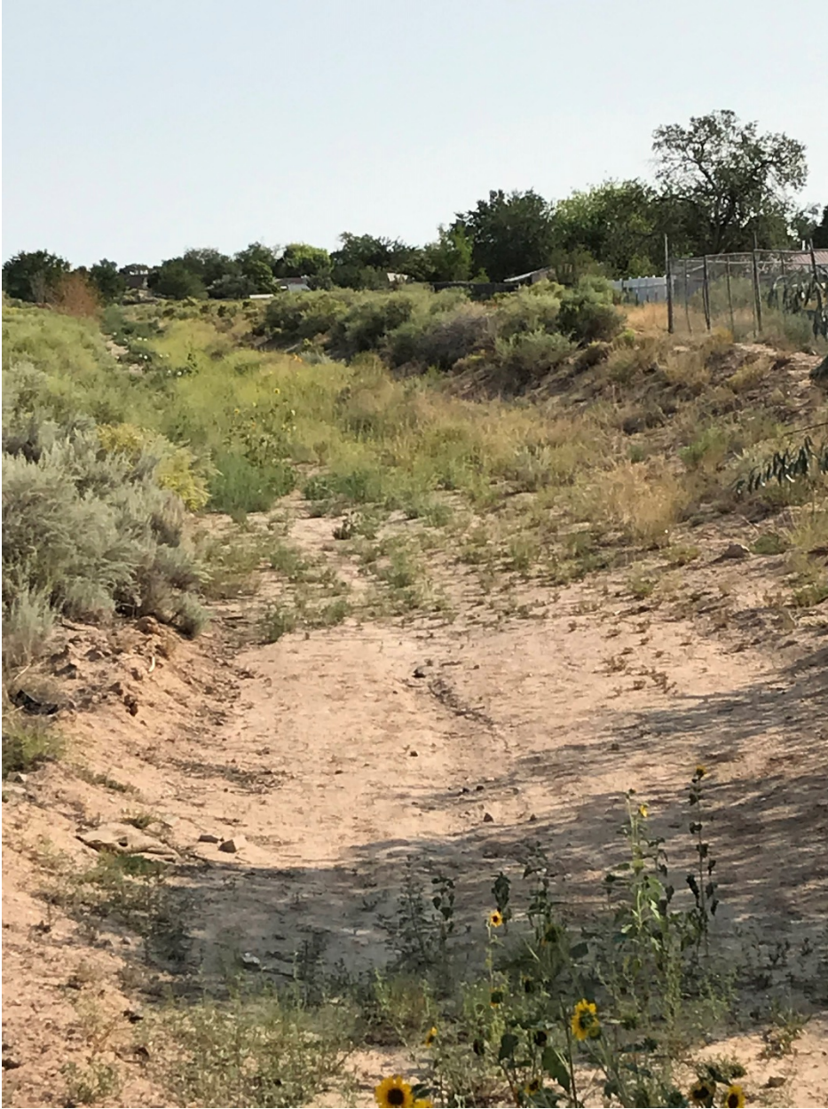
Site Visit 08-21-2020 Black Arroyo Location 1