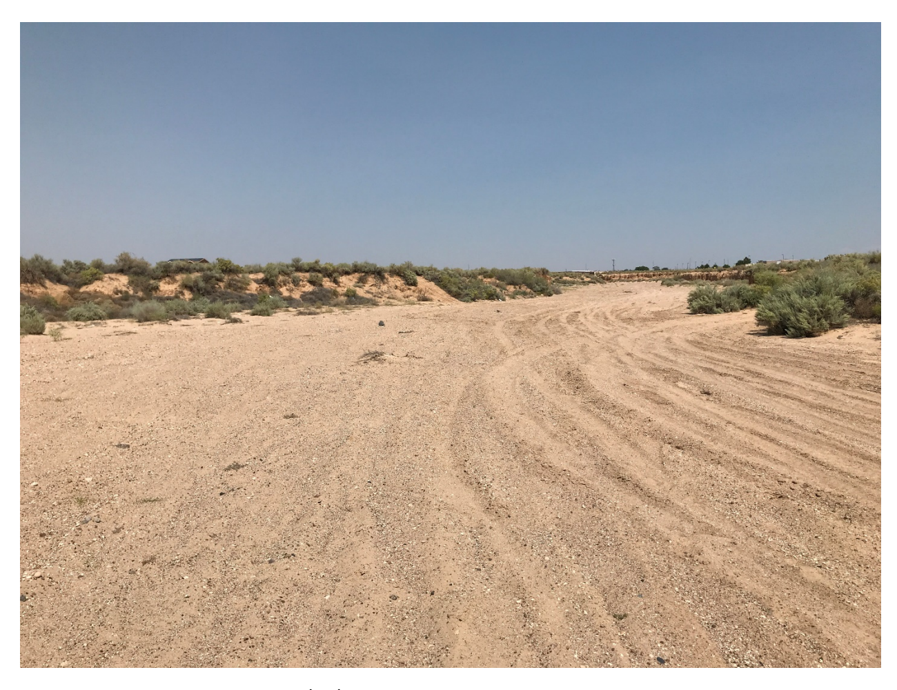
Black Arroyo Location 3 Site Visit 8/21/2020

Southern area of review site near Vargas Road SE looking upstream.