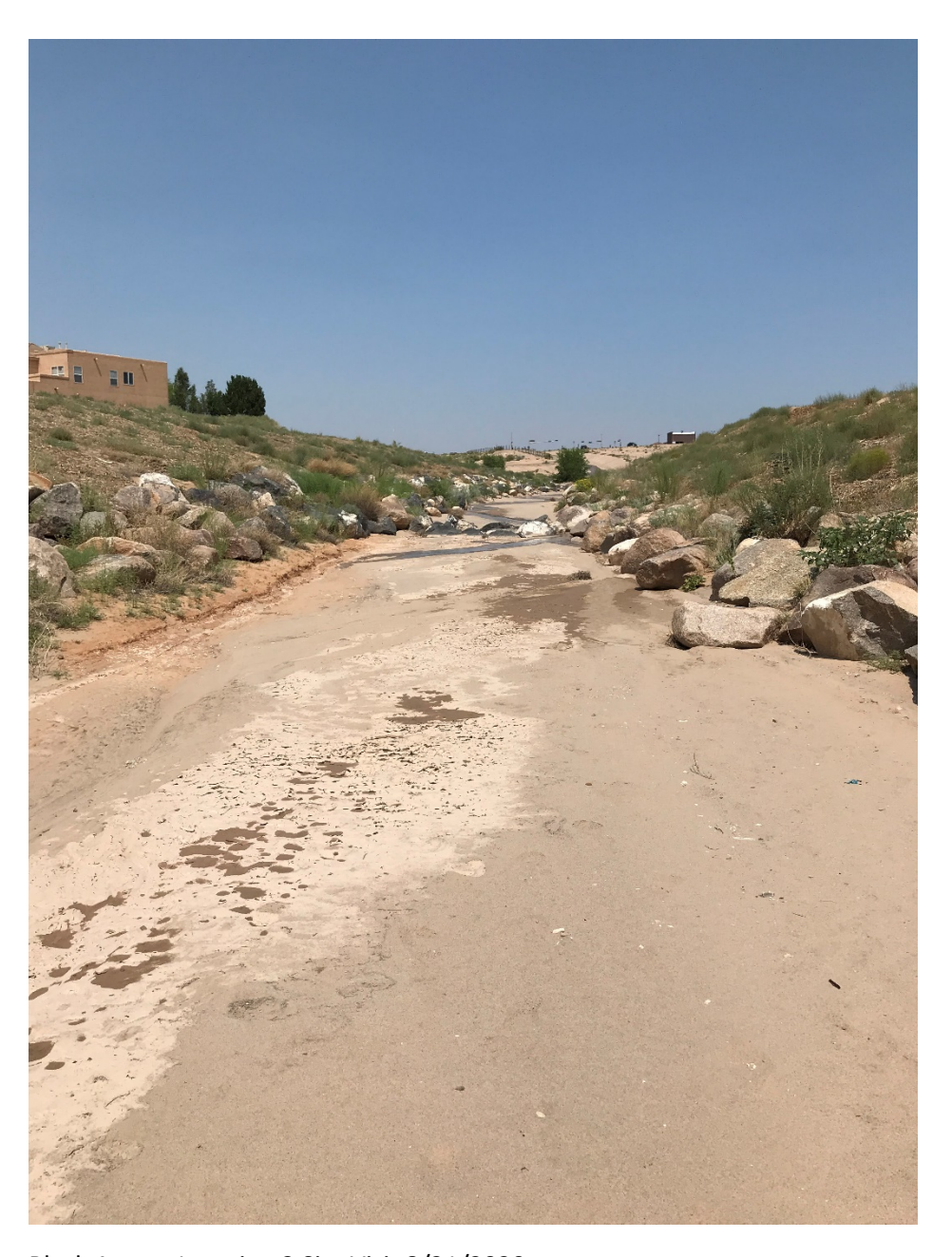
Black Arroyo Location 3 Site Visit 8/21/2020

Near Black arroyo Dam, you can see the furthest extent of the water, approximately 1.2 miles from the pipe discharging the water