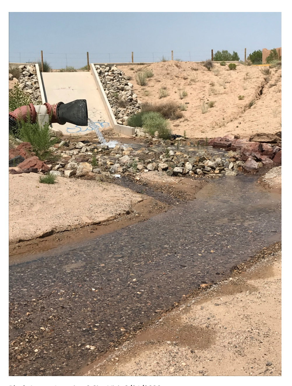
Black Arroyo Location 3 Site Visit 8/21/2020

Southern area of review site near Vargas Road SE looking at the City of Rio Rancho well discharge. When starting up the well, the City of Rio Rancho pumps some of the initial groundwater withdrawn out and discharges it to the surface of the Black Arroyo. This water travel approximately 1.1 miles before no traces of the discharge water can be identified. If the water were to travel further, there would have to be enough water collected to fill up the basin and gain enough elevation to go through the culverts at the Black Dam impoundment to the east of the discharge site. The Black Dam is approximately 4.25 miles from the Rio Grande. This would not be a jurisdictional water because it has no surface water connections to the Rio Grande or another A1-A3 water. This water also only flows related to groundwater pumping procedure performed by the City of Rio Rancho.