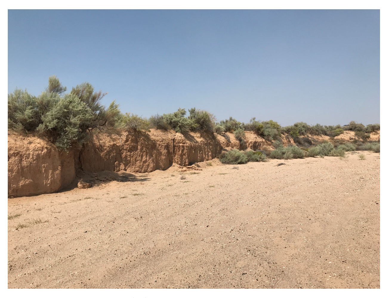
Black Arroyo Location 3 Site Visit 8/21/2020

Norther area of review site near 19th St SE looking upstream.