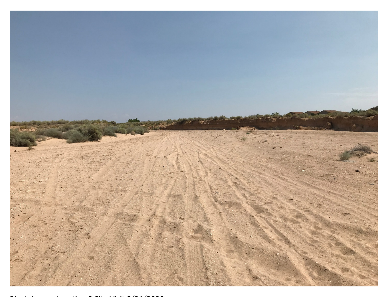
Black Arroyo Location 3 Site Visit 8/21/2020 Middle area of review site near 19th St SE looking upstream.