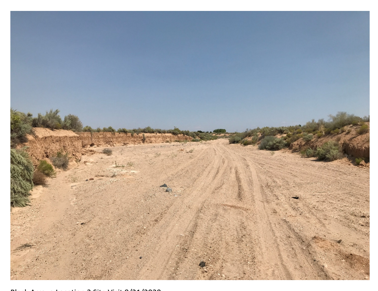
Black Arroyo Location 3 Site Visit 8/21/2020 Middle area of review site near 19^{\text{th}} St SE looking upstream.