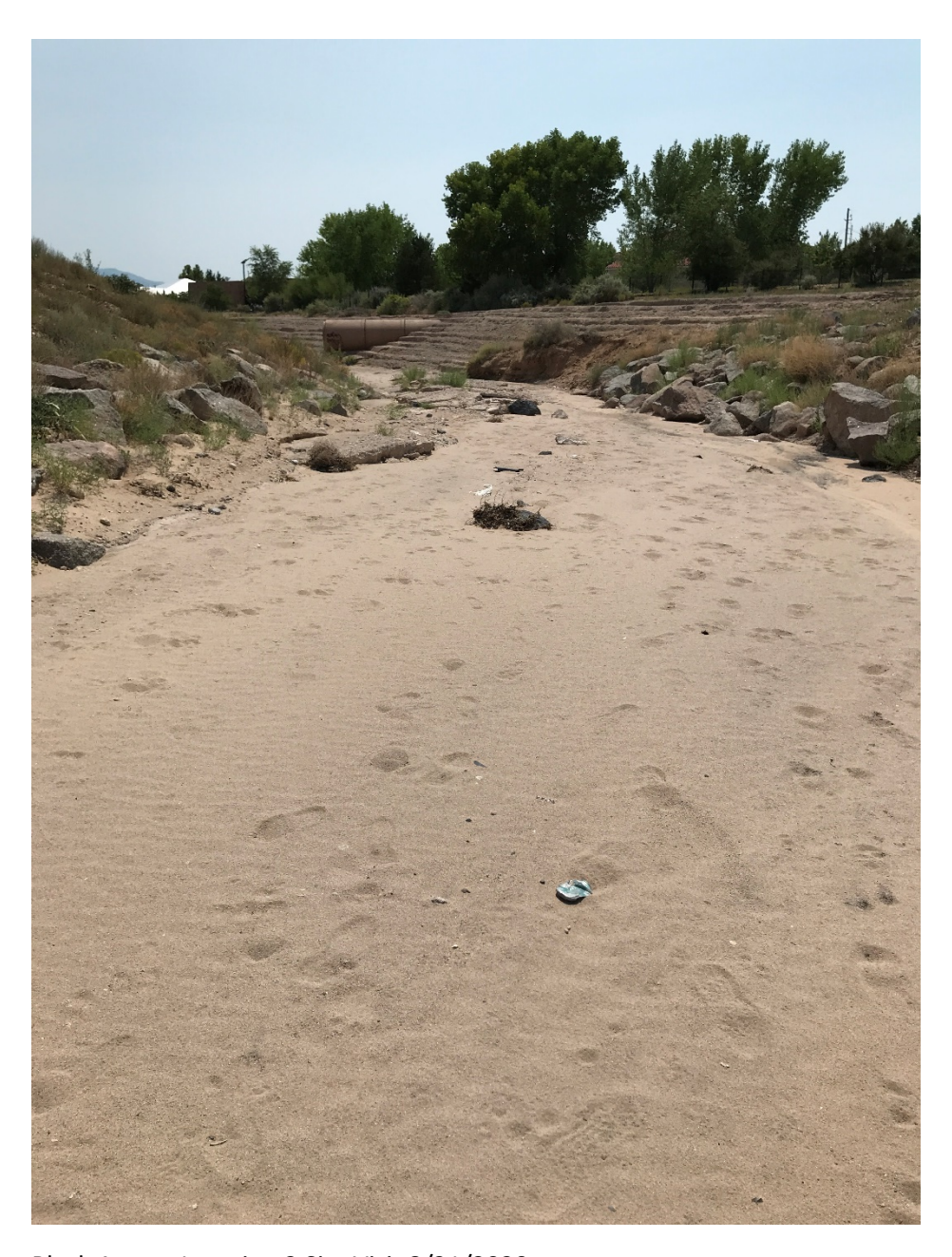
Black Arroyo Location 3 Site Visit 8/21/2020

Near Black arroyo Dam, looking downstream you can see no water has gone beyond this point approximately 1.2 miles from the pipe discharging the water