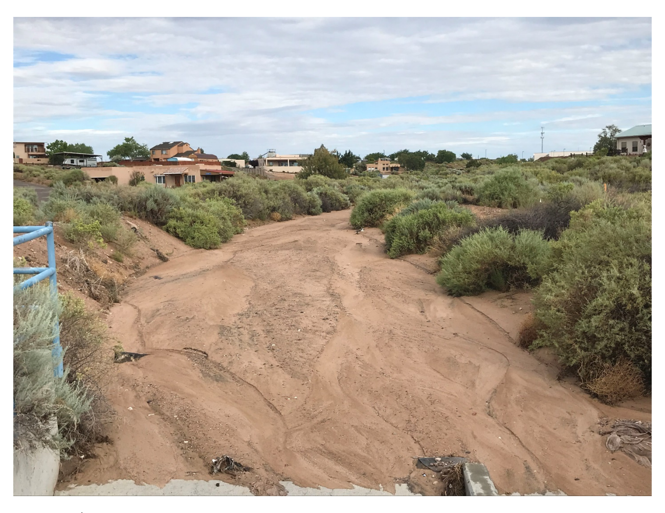
Site visit July 24, 2020

East end of project site at Sheriff Posse Road looking upstream. This photo was taken the day after 0.25 inches of rain fell in the area, no surface water was present.