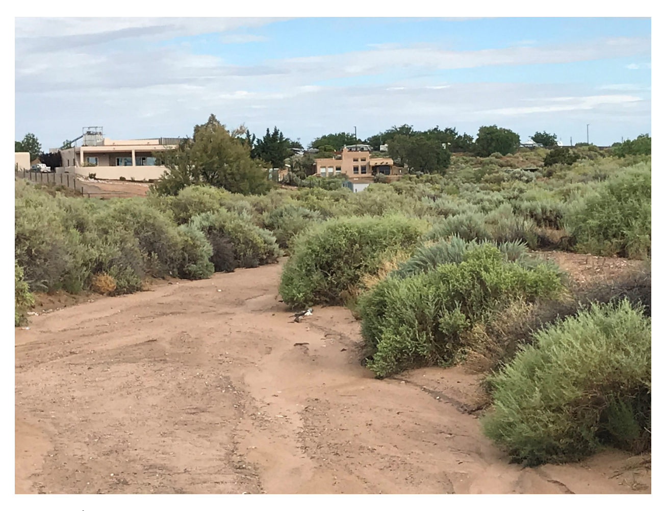
Site visit July 24, 2020

East end of project site at Sheriff Posse Road looking upstream. This photo was taken the day after 0.25 inches of rain fell in the area, no surface water was present.