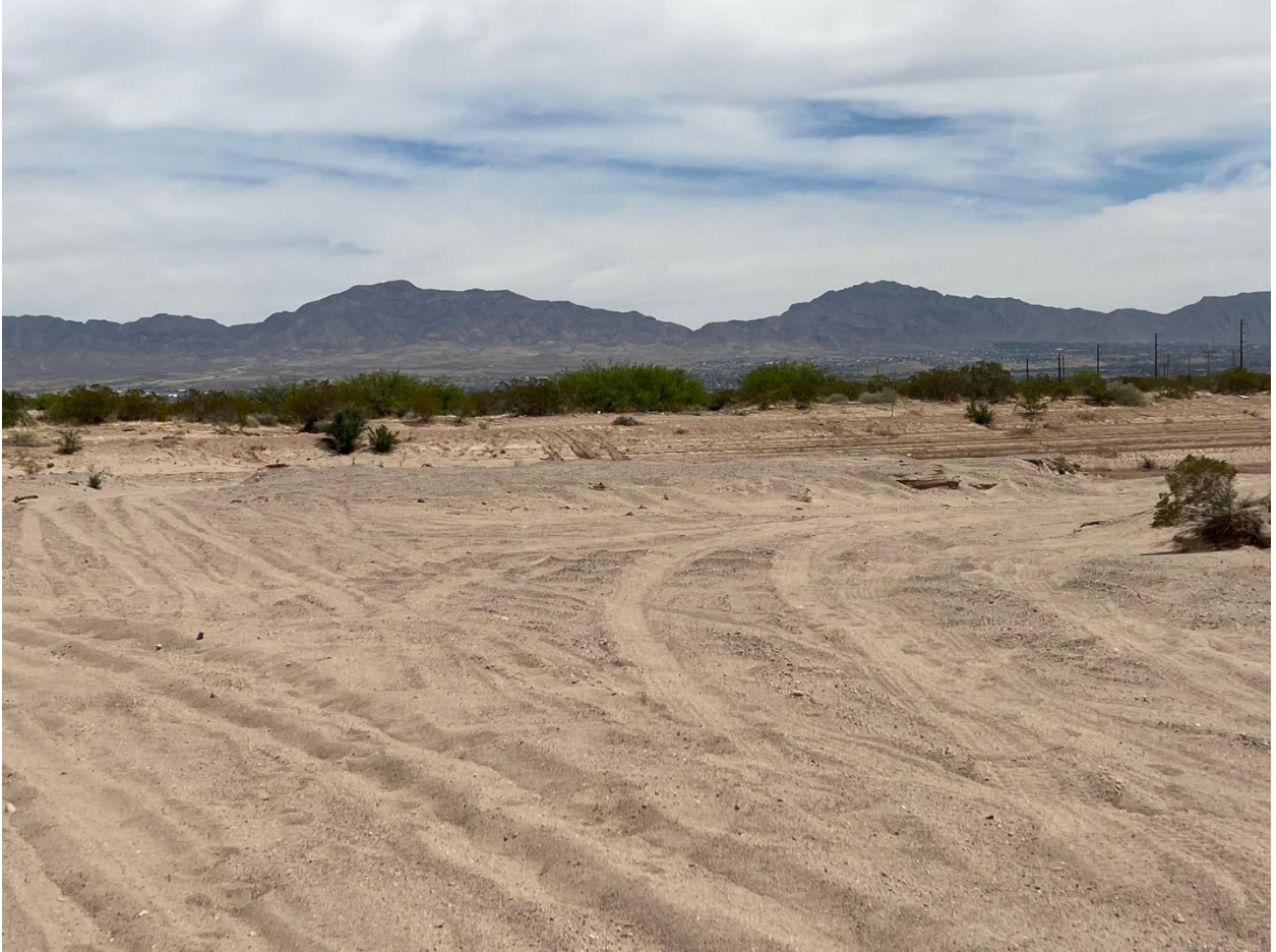
Photo 1 Arroyo 1 Terminus into the Southern Basin