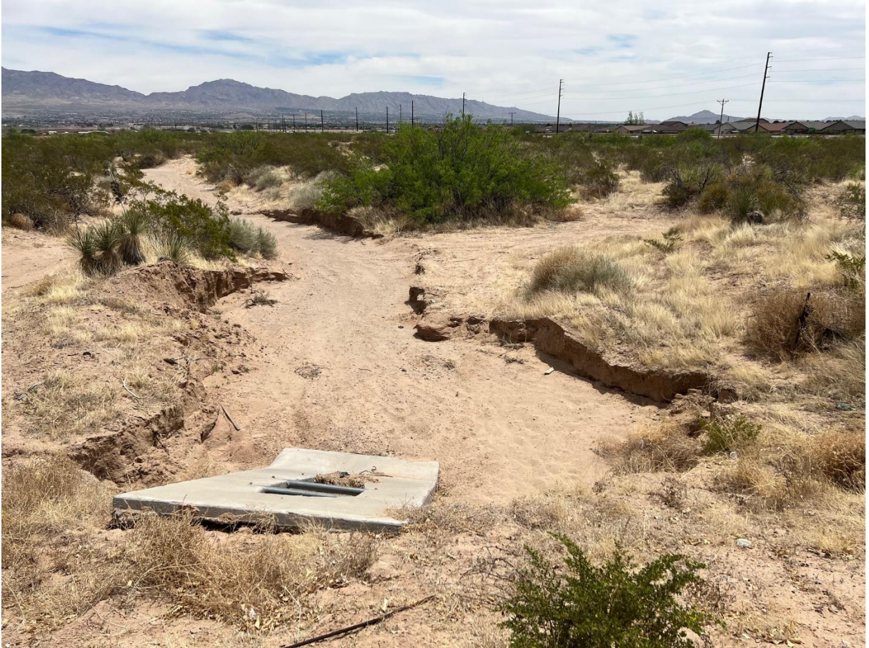
Photo 4 Arroyo 2 North of the Verde Development