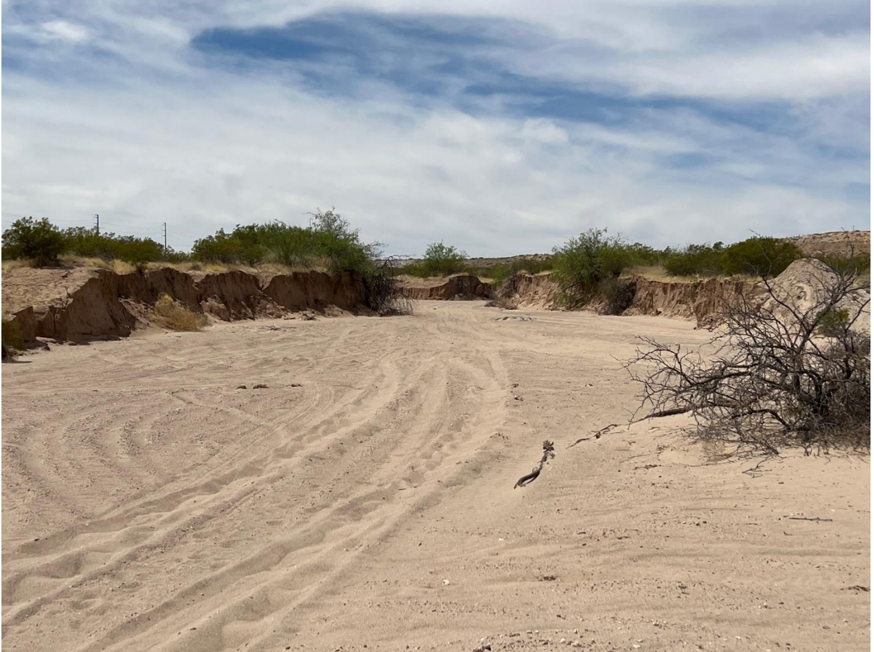
Photo 5 Arroyo 1 West of the Verde Development