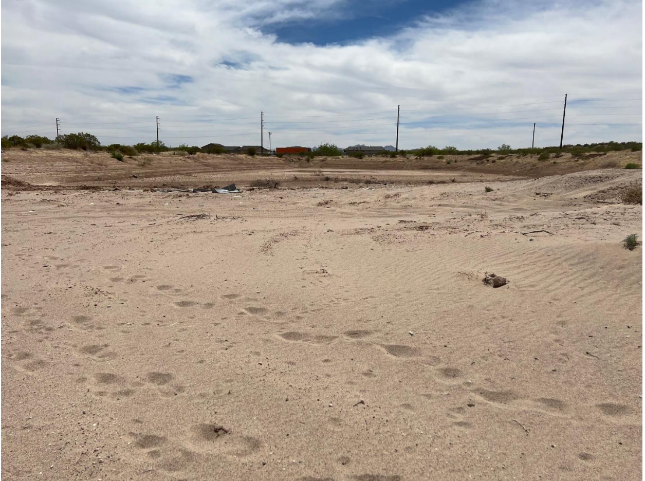
Photo 2 Southern Detention Basin