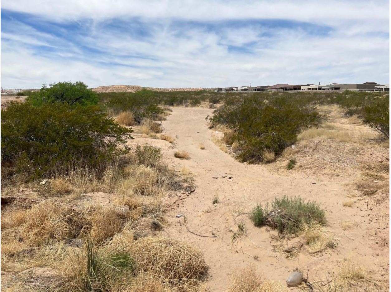
Photo 6 Arroyo 1 South of Verde Development