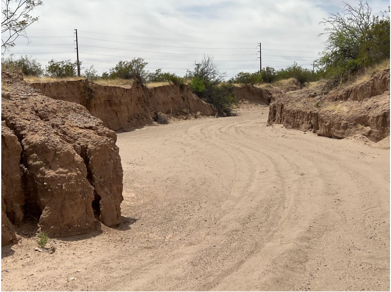
Photo 3 Arroyo 2 West of the Verde Development