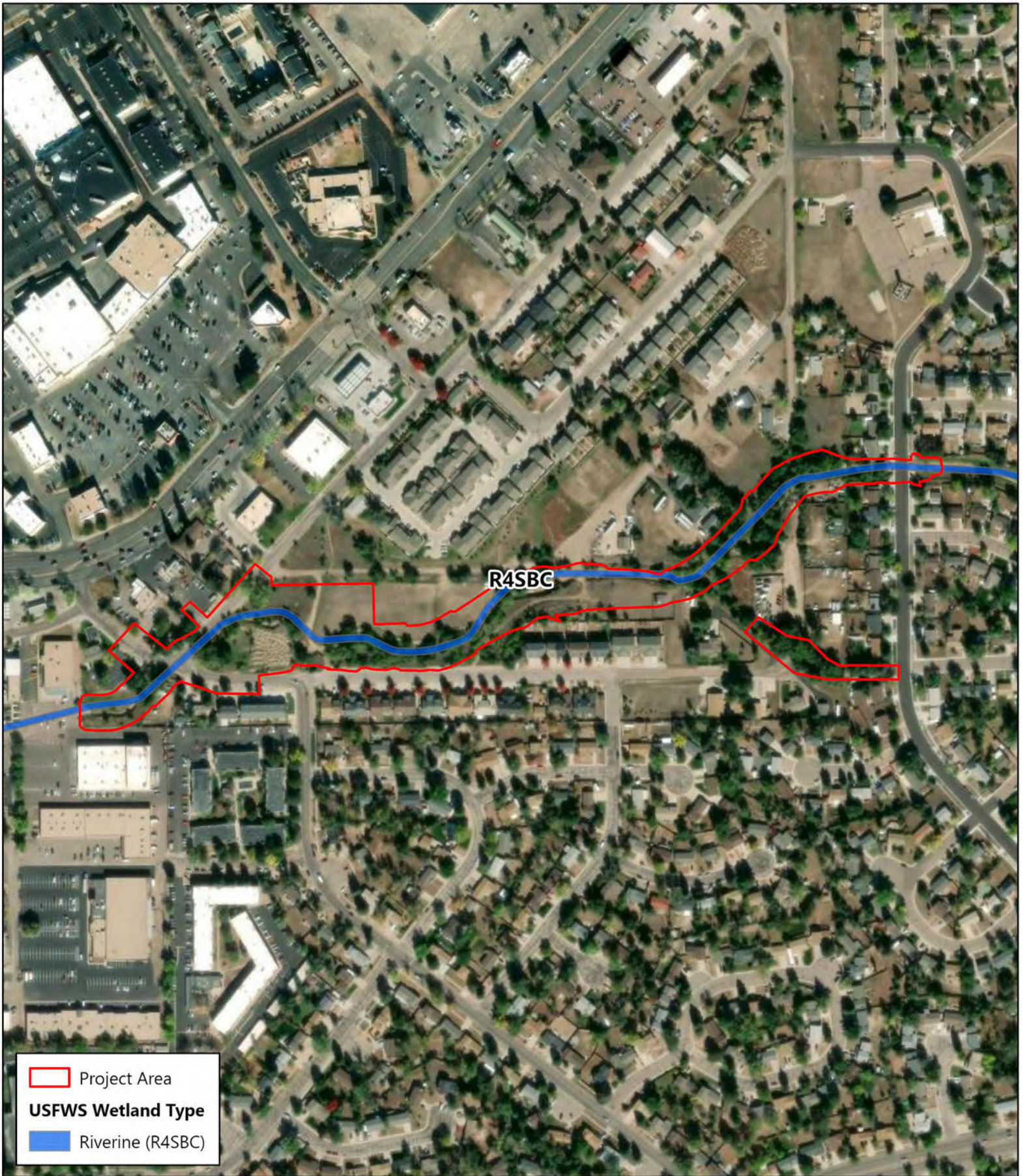
PARK VISTA DRAINAGE IMPROVEMENTS FIGURE 3: USFWS NATIONAL WETLAND INVENTORY

EL PASO COUNTY NAD 1983 STATE PLANE (2011) COLORADO CENTRAL SOURCE(S): ESRI, USFWS