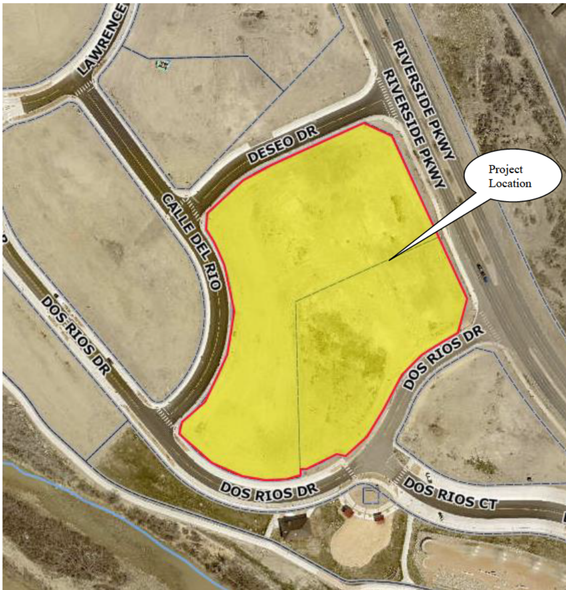
253 Unit Apartment Project Location

The purpose of this application is to obtain approval from the [REDACTED] [REDACTED] for a proposed mixed use development project located at 750 Callie Del Rio and 2600 Dos Rios Drive in Grand Junction, Colorado. The 5.5-acre project site is part of the Riverfront At Dos Rios Planned Development project located along the Colorado River, west of the Riverside Parkway, and south of Hale Avenue. The location of the project site is depicted below: