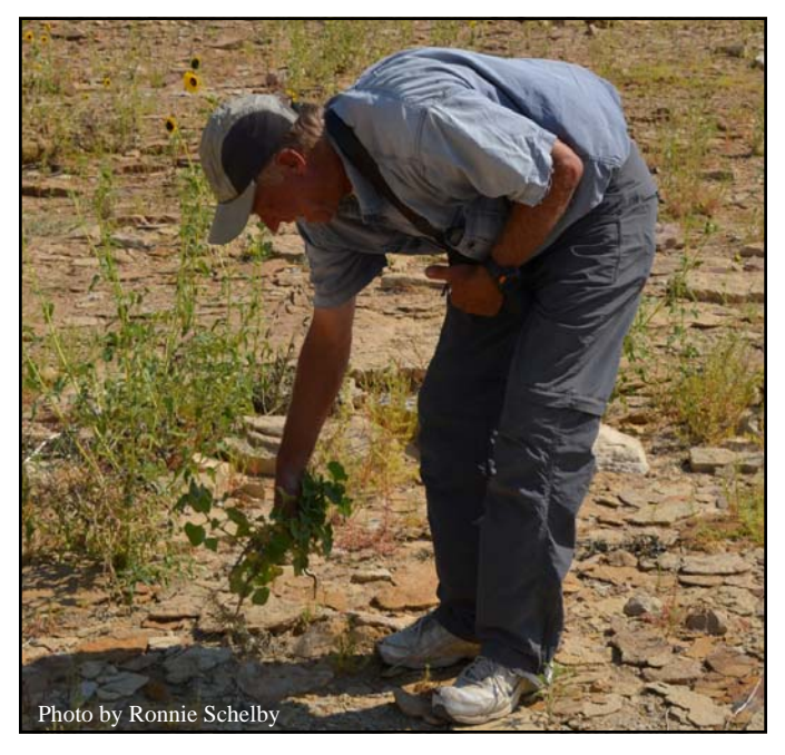
Rip Rap — October 2012 — Page 9