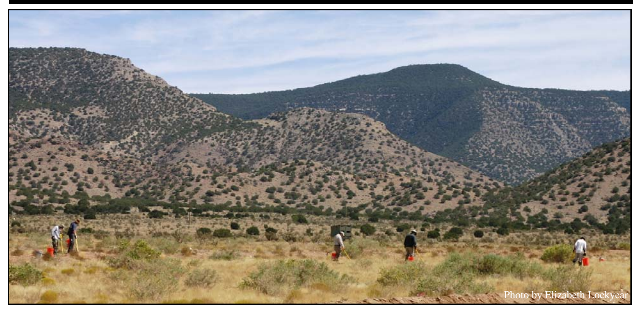
While a team works to sweep each 100-by-100 foot section of the site and collect munitions debris, everyone else stays a minimum of 374 feet away, in case live munitions are discovered.