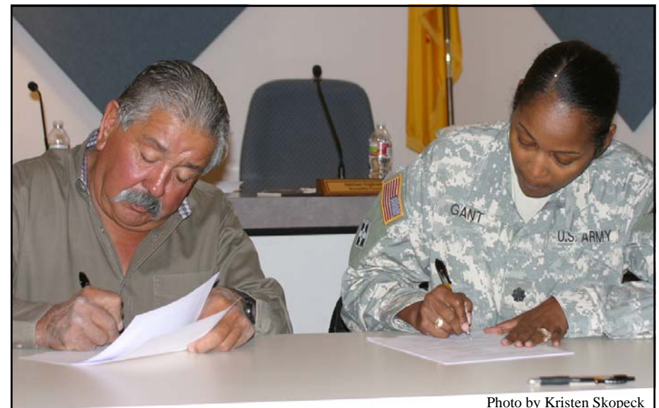
By signing the cost-sharing agreement, the Corps' and MRGCD commit to a feasibility study to construct a 50-mile stretch of levees.

At the Middle Rio Grande Conservancy District (MRGCD) board meeting Sept. 10, District Commander Lt. Col. Antoinette Gant