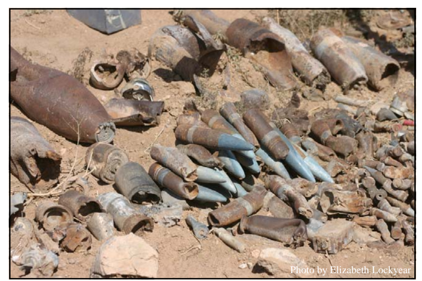
Teams have found an assortment of ordnance at the Kirtland site.

of debris and excavation of the pits are just the start of the project. Other actions will follow, like soil sampling to determine any possible soil contamination from chemical compounds in conventional munitions and removing the soil