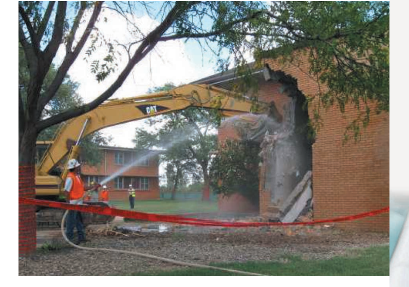
Dorms Demolition Work, FY10 Small Business Award Cannon AFB, Clovis (NM)